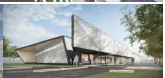
Images are reproduced with the permission of Lyons, Woods Bagot, H2O, Cox Architecture & Design Inc.